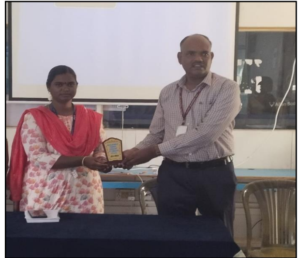
Honouring the Resource Person