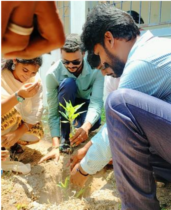
Chief Guest along with staff and student driving the sapling