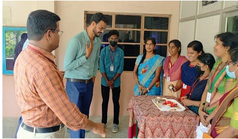
Civil Staff and Students welcoming the Chief Guest and Principal